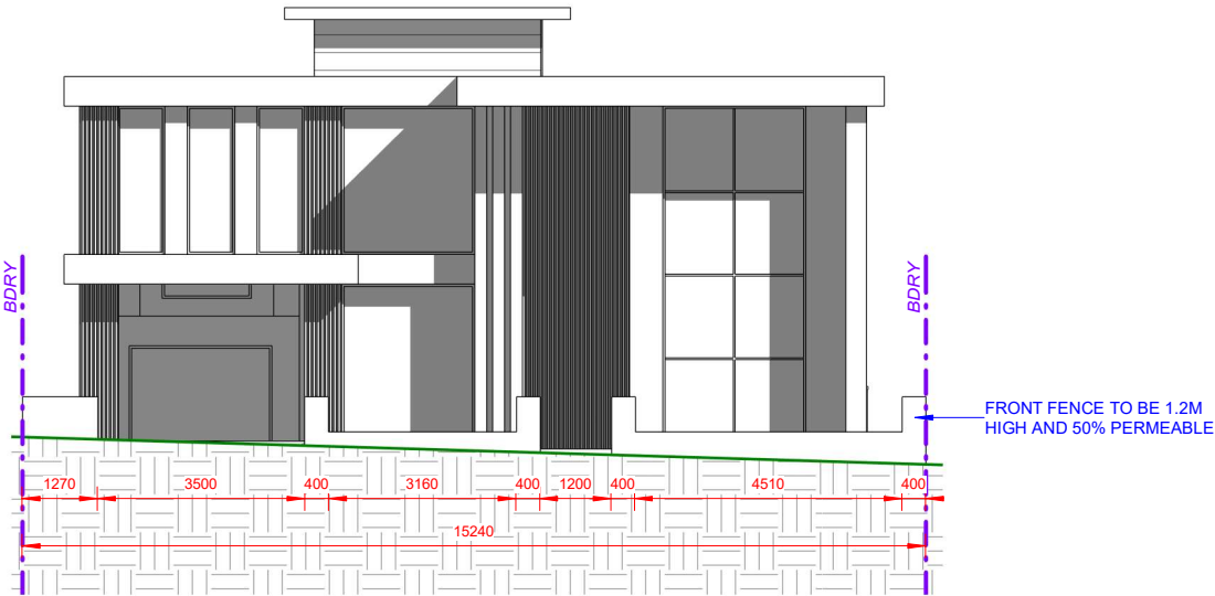
2 FRONT FENCE ELEVATION 1 : 100